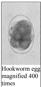
Hookworm egg magnified 400 times